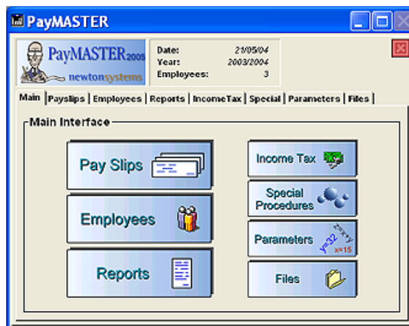
The Main Interface